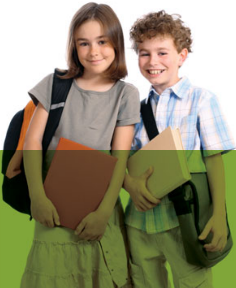
ACTUAL STUDENT POPULATION